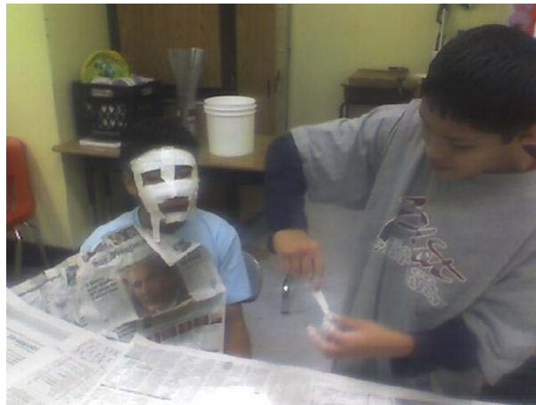
Ninth graders at East Palo Alto High School create autobiography masks in art class in preparation for their Autobiography exhibition.

Exhibitions have become integral to the college-going culture at East Palo Alto High School, in partnership with Stanford University and Canada Community College. One graduate of the school reported, "Exhibitions really prepared each student for exactly what they needed in the future.... My reading got much better than it was before. My writing: my essays are better, more detailed."